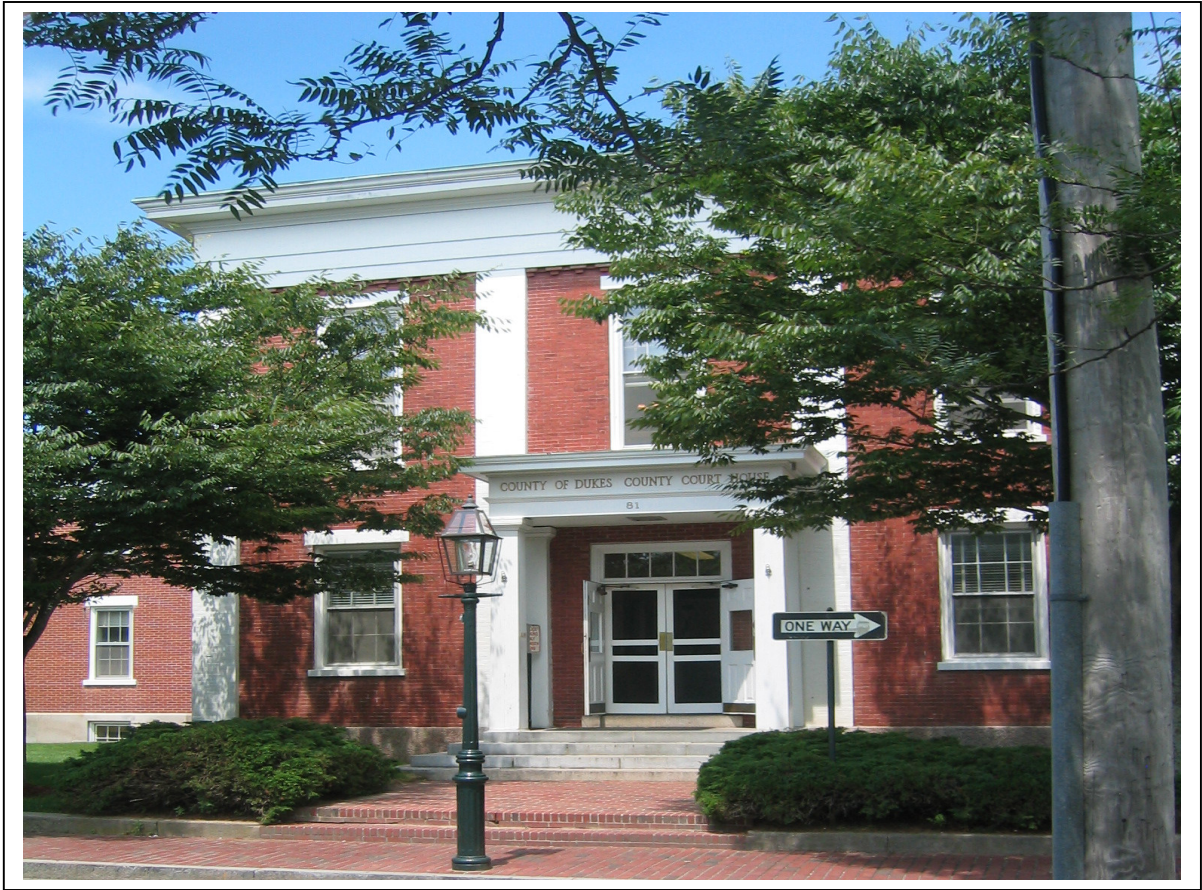
The County of Dukes County Courthouse, owned by the County (above) and State Beach, managed by the County (below).